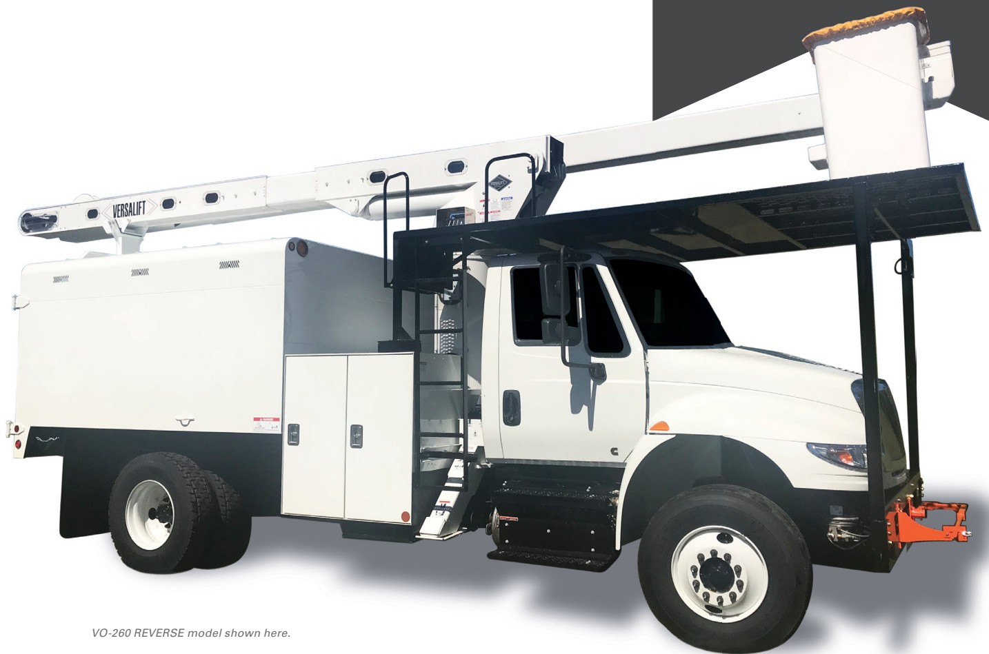
VO-260 REVERSE model shown here.