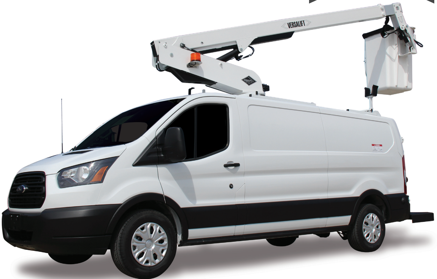
VANTEL-29-NE TRANSIT model shown here.